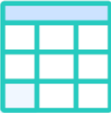
Historic 6th Form Funding trend