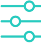
Future 6th Form Funding Profile